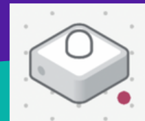
Physical Light Sensor

Explicitly show students the difference between virtual and physical blocks. Physical are shaded in and next to 'Connect' button, while virtual are an outline. When physical are paired, students need to drag the physical block version on to the workspace.